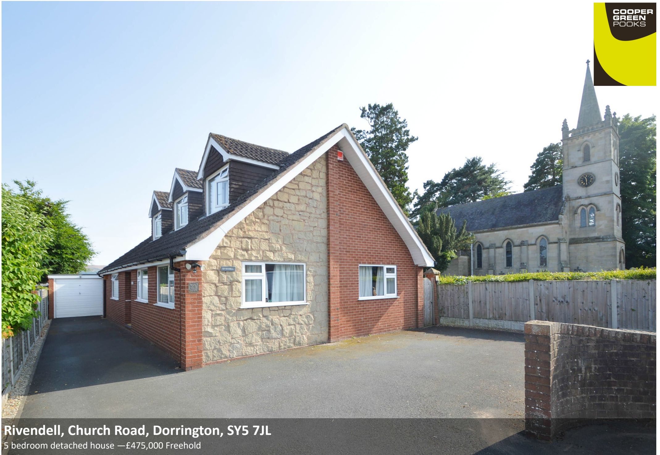
Rivendell, Church Road, Dorrington, SY5 7JL

5 bedroom detached house —£475,000 Freehold